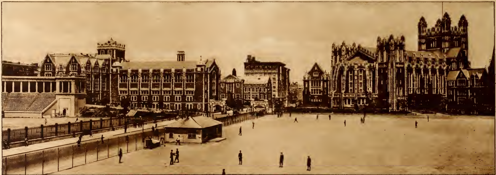
COLLEGE OF THE CITY OF NEW YORK, at 138th Street and Amsterdam Avenue, with a view of the open space devoted to athletics.